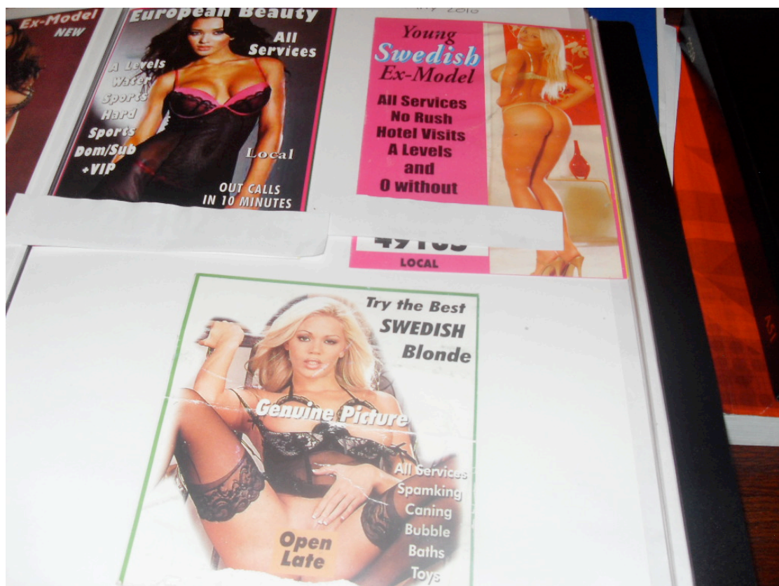
Figure 3: Images 3, 4 and 5 of European and Swedish Women

description of one of these women on the cards reads, “Young Swedish Ex-Model”. This description serves to emphasise the idea that the women advertising their sexual services are former models. Once again, this reinforces the impression that essentially women in sex work are thin and flawlessly beautiful. It also leaves further room for exploration of the assumption that women in sex work embody a physically fit body image of perfection. They are not the ‘vectors of disease’ discourse exemplified in the literature.