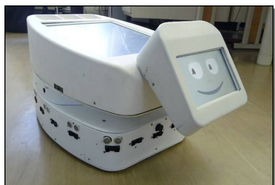
Fig. 1. The IROMECC robot in the horizontal configuration (early prototype version).

The IROMECC robot [36] has two different configuration possibilities: horizontal and vertical. In the horizontal configuration (see fig. 1) the interaction module is attached to the mobile platform in order to support a complete set of activities requiring a wider mobility and dynamism of the robot. In the vertical configuration the interaction module is connected to a dedicated docking station to provide both stability and recharging. Additionally, the robot has several interfaces such as dynamic screens for input and output, buttons and wireless switches. In order to satisfy the needs of children with autism, the robot is also equipped with a simple mask to cover the small face screen.