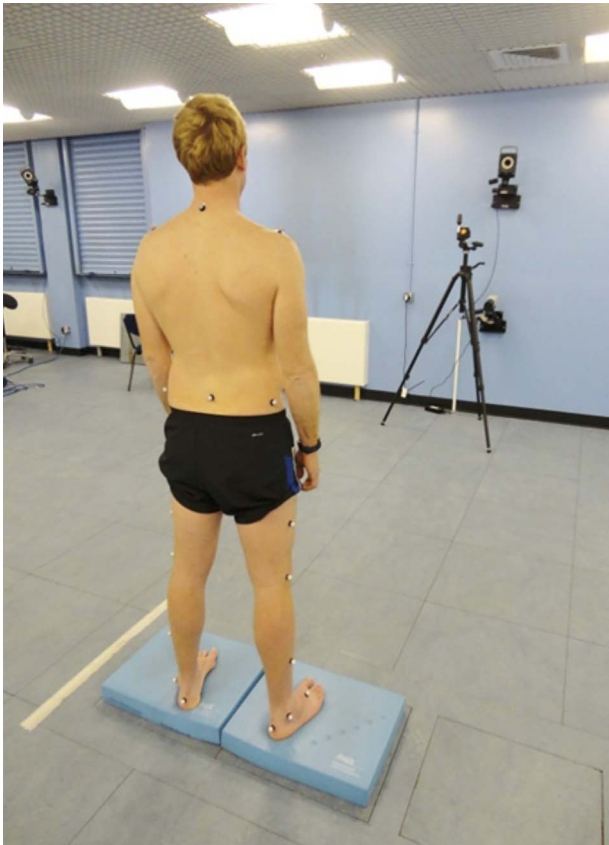
Figure 2 Participant standing on foam cushions overlying force plates.

A rest period of 20 s occurred between each 40 s trial. Sufficient trials were performed to enable three valid sets of data to be recorded. A test was invalidated if the participant: (1) moved their foot position during the test; (2) changed their arm starting position or (3) opened their eyes during an eyes-closed task.