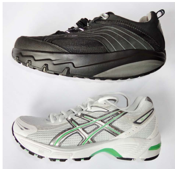
Figure 1 Study shoes: rocker-sole shoe (top); flat-sole shoe (bottom).

Data collection occurred at the 'One Small Step Gait Laboratory', Guys' Hospital, London. Demographic, back-pain disability (Roland-Morris Questionnaire) and pain scores (numerical rating scale) were recorded at baseline.