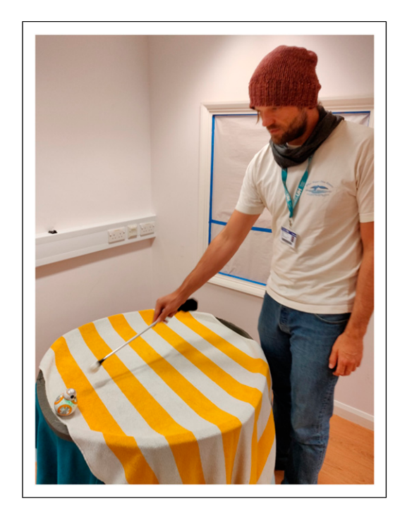
Figure 2. The first author using the interaction tool. He nudged the robot with the white end of the wand. Participants were able to freely choose a position around the table for observing or interacting with the robot.

participant at one particular side of the table which had no border and therefore permitted the robot to fall off the table. We hypothesized that this encourages interaction with the robot and that participants would see that the intrinsically motivated robot adapts to their input. Furthermore, we hypothesized that an intrinsically motivated robot, which explores the area and the interaction with the participant would be perceived as having higher agency and competence. This design was not entirely successful. The intrinsically motivated robot could not sense the edge. Therefore, when it approached participants they did not consider it as approaching them, but judged the robot as rather suicidal. In consequence, the participants judged the robot as less competent, despite its ability to adapt (cf. Scheunemann et al., 2019, sec. 5). This is a good example of why it is critical to consider the participants' expectations when choosing a robot and designing a study.