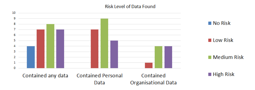
Figure 3. Assessment of level of Risk of the data recovered

one file that was flagged as malicious by at least three anti-malware scanners). This is a significant portion of the sample, and indicates an absence of suitable protection mechanisms in the region. It also suggests a risk to using second hand disks or devices.