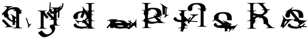
Figure 4. This still from Harm van der Dorpel’s I Wouldn’t Normally Do This Kind of Thing (2005), captures a moment when the component parts that are used to construct letterforms are in the process of realignment. These forms exhibit many of the telltale features of letters, hinting at their potential for verbal signification. However, this particular moment, they have no precise verbal meaning. Source: Harm van der Dorpel, ‘I Wouldn’t Normally Do This Kind of Thing,’ Harmlog , 2005, January 15, 2007 http://www.harmlog.nl/harm/harmlog/main.asp?id=77&action=prev&sort=1

Asemisis itself performs a function in these “phases of legibility”, contributing to preparing the viewer to seek out language. In fluid forms which resemble verbal signs, even when their identity cannot be precisely identified, the audience may make use of visual signifiers of paradigm. The suggestion that these forms are some sort of language, though unidentifiable, helps to encourage the viewer to approach the artefact with the expectation of reading. Once they have prepared themselves to take the role of reader rather than viewer, they may more quickly identify the linguistic identity when it begins to emerge, in effect, increasing legibility. The appearance of, for example, ascenders and descenders during a metamorphosis can prepare the viewer to accept the forthcoming identity as verbal rather than pictorial. In Harm van der Dorpel’s Type Engine , and I Wouldn’t Normally Do This Kind of Thing (2005) the regular spacing and consistent baseline of abstract forms helps to suggest to the viewer that these forms will have linguistic meaning once fully formed (Fig. 4).