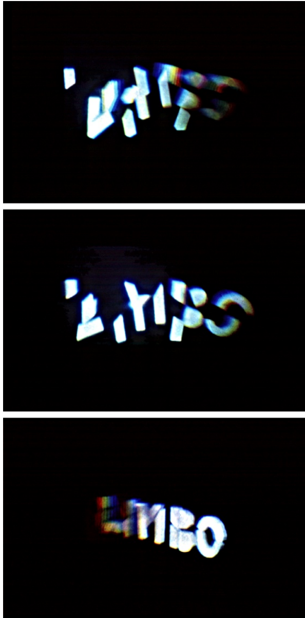
Figure 2. Eduardo Kac, Souvenir D'Andromeda 30x40cm, digital transmission hologram, 1990, Collection Acqaviva-Faustino, Paris. Kac's holographic forms appear to float within the real space between the viewer and the surface of the hologram. The letters of the word 'LIMBO' are composed of apparently three-dimensional objects which align to form letters when seen from the "viewing zone".

Remarkably similar behaviours are observable in onscreen artefacts. In BB/Saunder's Fear ident (Fig. 3), ethereal dots slowly drift through an empty corridor. The experience of holopoetry is replicated, or at least imitated, on screen, with the tracked motion of a camera as a substitute for viewer navigation through gallery space. As the camera tracks through the corridor, the arrangement of dots can be seen at an angle from which it momentarily appears to present the word 'fear'. The ethereal appearance of the dots is suggestive of a ghostly apparition, while the temporary and ephemeral nature of the text identity connotes an uncertainty and insecurity that is a feature of many horror films/programmes. These dots are not only unfamiliar, but unexpected in the corridor setting, making it simpler to perceive them as part of familiar linguistic forms, understood as a graphic overlay of a kind that is common to television idents.