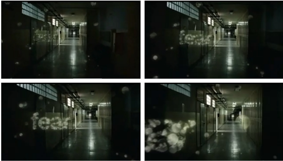
Figure 3. BB/Saunders, Fear , ident for Five, 2006.