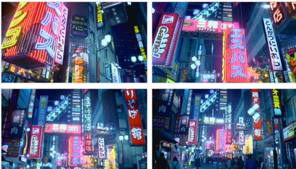
Figure 1. MPC, Tokyo, Channel 4 ident, 2006. Source: MPC, ‘Channel 4 Idents,’ The Moving Picture Company , 2006, July 17, 2011 < http://www.moving-picture.com/index.php?option=com_content&view=article&id=341&catid=38&Itemid=926 >

of most print or screen-based signs. In Dan Waber’s typographic animations, Strings (2005), words appear as single strings which unravel and reform into different words; in MPC’s Channel 4 idents (2004-2012) architectural objects align to present the figure ‘4’ (see Fig. 1); in BB/Saunders’ series of idents for Five, words are formed from groups of independently moving objects, including the word ‘free’ from balloons and ‘fear’ from ethereal floating dots; and in Harm van der Dorpel’s Type Engine (2005), abstract polygons rearrange to form a sequence of different letters. These and other examples are available online at www.fluidtype.org/typology.html . In all of these artefacts, the identity of forms appears to change over time. At one moment they may appear typographic, but at another they may appear pictorial or abstract. Each form adopts multiple identities over time. This kind of behaviour is distinct from “motion” (a change in location that does not affect the identity or shape of a sign), and from other forms of “kineticism” as identified by numerous theorists in the field of temporal typography. In existing studies of onscreen temporal typography, there is no adequate terminology to describe typography that transforms to the extent that it adopts new identities. These forms, which are a hybrid of typography and other paradigms, cannot be considered purely as descendants of static typography.