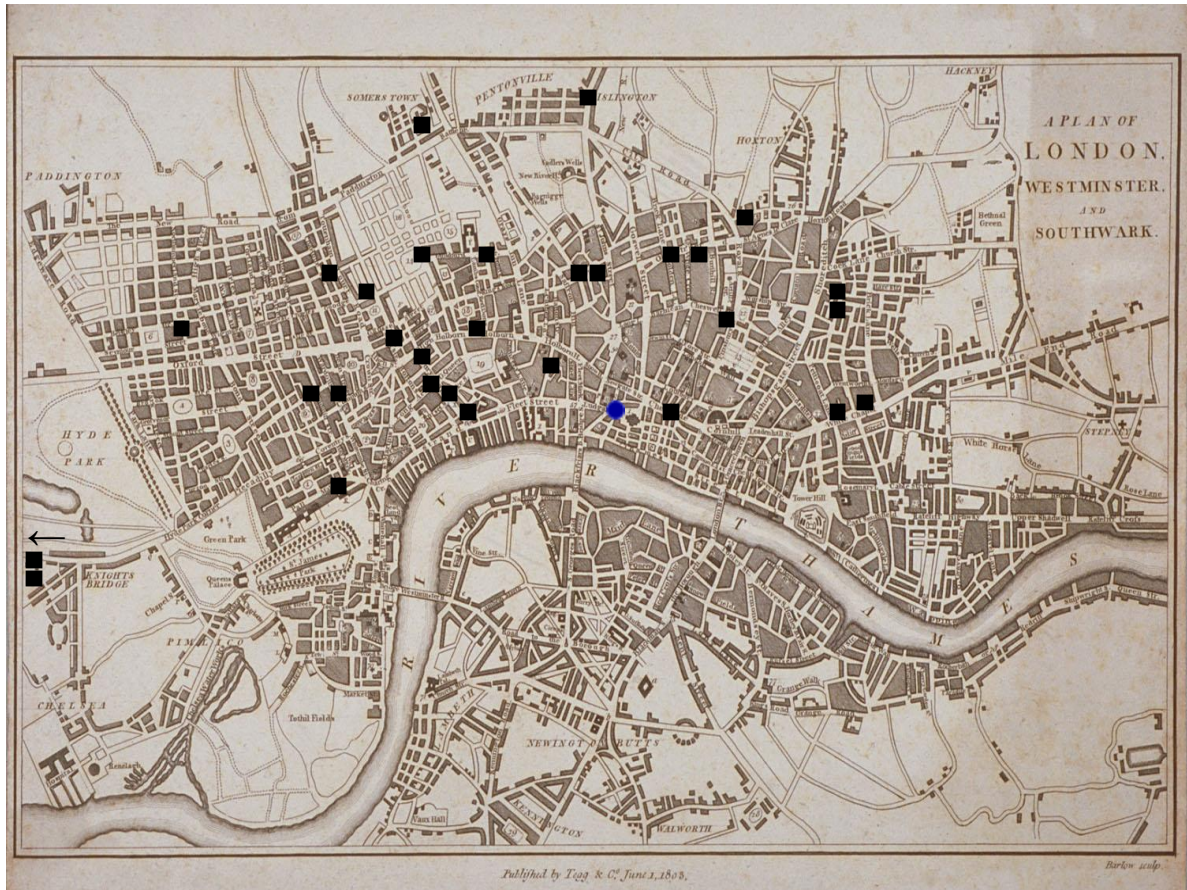
T. Tegg, Map of the City of London, City of Westminster, River Thames, Lambeth, Southwark and Surrounding Areas (London, 1803).