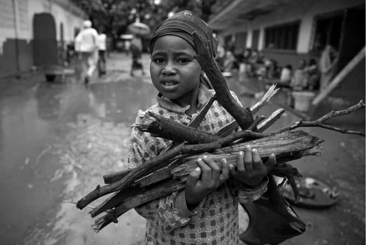
Above: A child collecting firewood walks along a flooded road in a Muslim district of Bangui, Central African Republic.

a civilian administration or functioning security forces to counter ongoing Séléka abuses, and in the face of Séléka's refusal to disarm and disband, law and order quickly broke down. Though its victims at times included Muslims, the UN Secretary-General and others noted that Séléka raids and attacks continued to particularly target non-Muslims. In the security vacuum, civilians turned to self-defence. Christian communities set up or activated existing 'anti-balaka' (anti-machete) groups to protect their areas from attack and to oust the now 'ex-Séléka', particularly its foreign fighters, seen as invaders. For their part, some Chadian and Sudanese ex-Séléka sought support among those who shared a common language with them – the CAR's Arabic-speaking Muslim minority. As with the Séléka during its advance, the prevailing climate of violence allowed existing prejudices against ethnic minorities to be acted out with impunity. In numerous instances and locations, anti-balaka militias targeted members of the