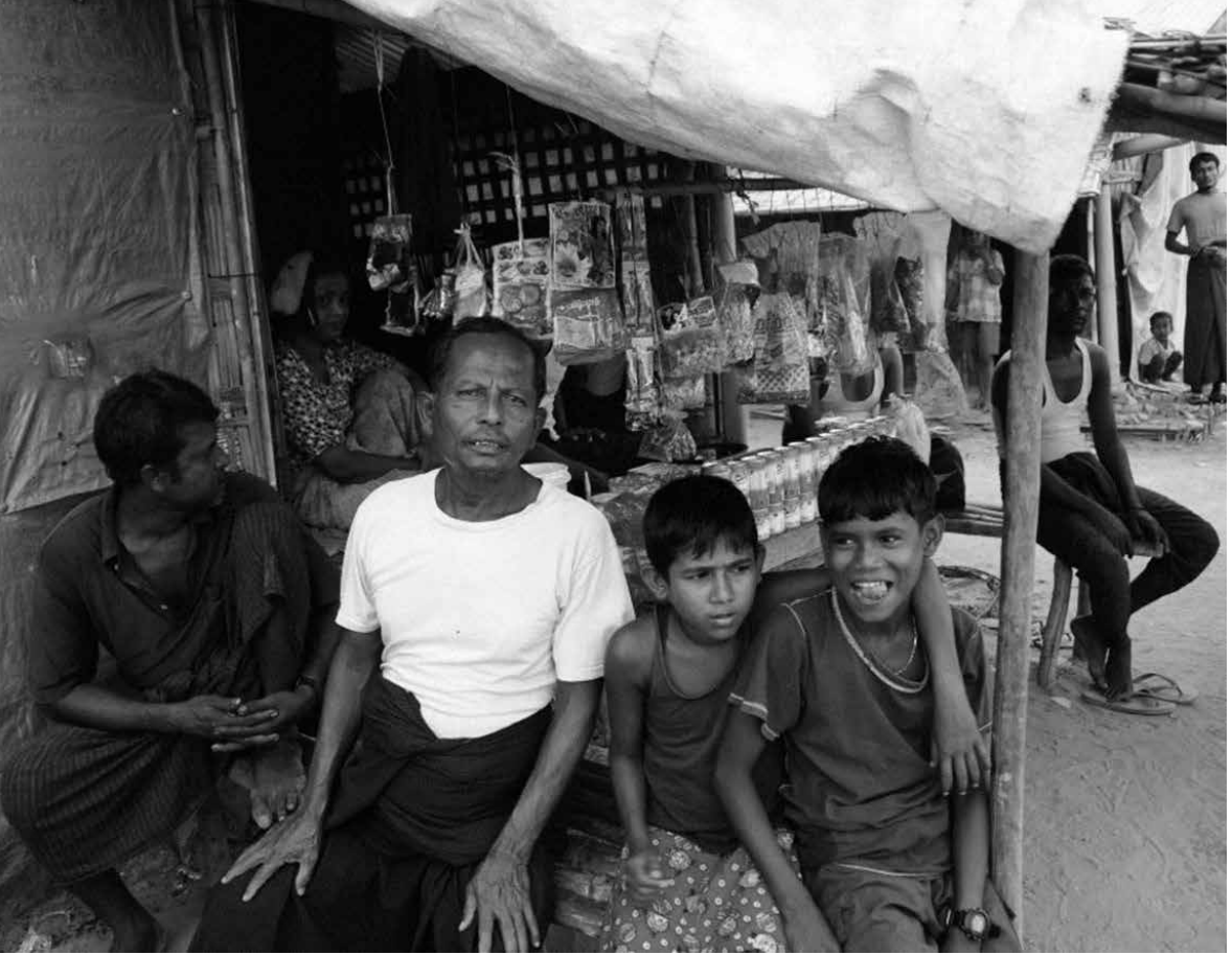
Above: Rohingya Muslims in Burma. Rakhine State, November 2013.