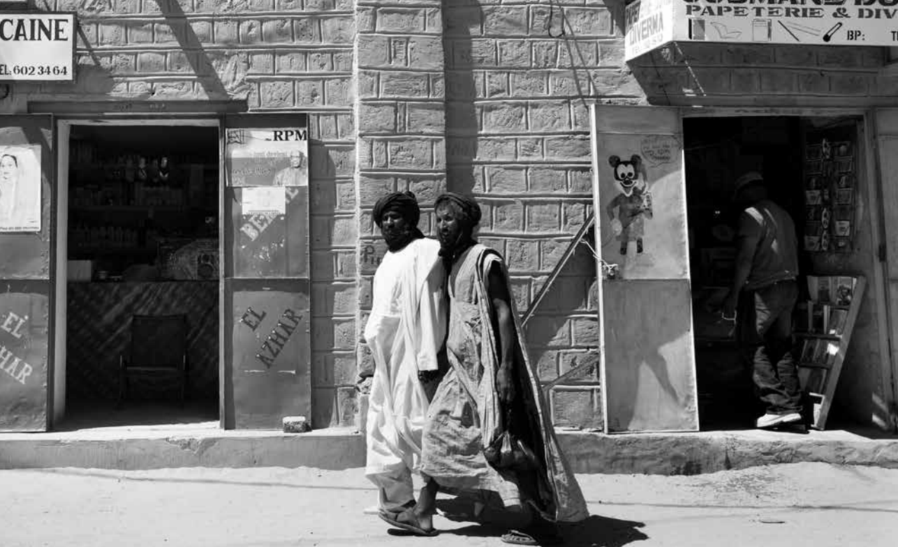
Above: Tuareg men walk past some shops in Mali.

The political parties signed a joint declaration of non-violence in April, committing to peaceful means for resolving disputes. However, after more demonstrations in May, some of which led to ethnic violence in which at least a dozen people were killed and scores injured, including by security forces, the polls were postponed. Amid ongoing tensions, in July the UN Human Rights Council passed a resolution calling for peace and condemning all incitement to ethnic or racial hatred. Elections went off peacefully in September; however delays in issuing results led to accusations from the opposition of potential fraud.