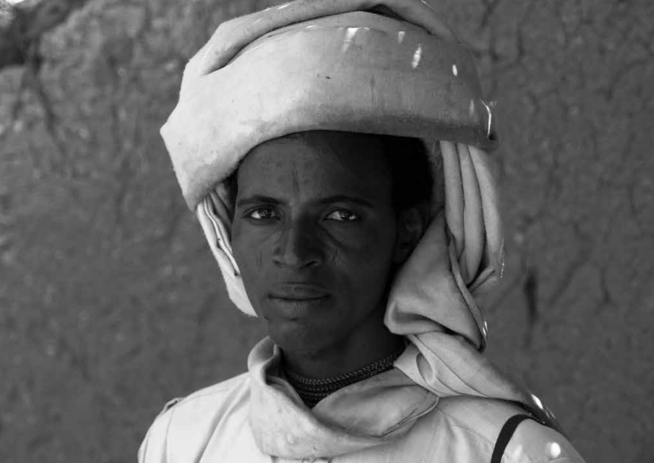
Above: Mbororo man in Cameroon.

colonies, one British and one French; since independence it has had two presidents. The current one, Paul Biya, took office in 1982, introducing multi-party politics several years later. It is religiously and ethnically diverse: minority and indigenous groups include forest-dwellers, such as Ba'Aka in the south, and nomadic pastoralist Mbororo in the north. In 2013 Cameroon saw a number of cross-border incidents from Boko Haram in Nigeria and Séléka in the CAR. At year's end there were more than 100,000 refugees and asylum seekers in the country, primarily from the CAR, Nigeria and Chad.