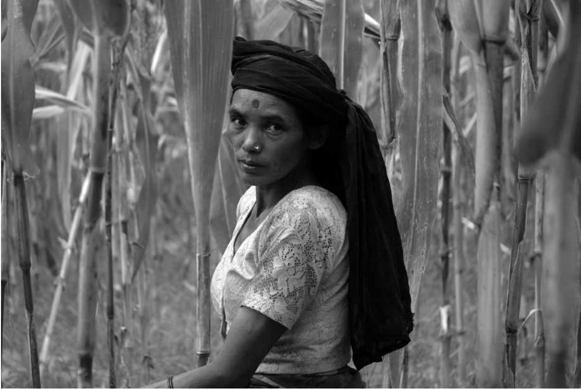
Above: Dalit farmer in Nepal.

April, the Supreme Court issued a notice to the central government and the Election Commission of India, advising that there should be stronger regulations on the use of hate speech and incitement to violence by elected representatives. This request is complicated, however, by immunity provisions for parliamentarians, bestowing freedom of speech for anything said in parliament or in a court of law. Continued attacks on minorities also renewed calls in support of a draft anti-communal violence bill. Continuing on provisions made from a similar draft bill in 2011 that stalled in parliament, the new draft bill seeks to protect minorities against violent attacks and imposes duties on the central and state government to prevent and control violence. NGOs in Madhya Pradesh welcomed the bill, as there is no strong central law to protect minorities against violence, ensure reparations for victims or hold perpetrators, especially politicians, accountable for their role in violence. By December, the Prevention of Communal and Targeted Violence (Access to Justice and