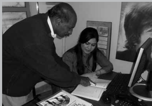
Left: Staff at the National Commission for Justice and Peace in Pakistan work on their study of hate content in textbooks.