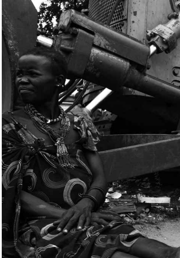
Above: Murle women sit beside an abandoned tractor near their shelter in Pibor, South Sudan.

South Sudan’s domestic law prohibits hate speech and incitement to violence, such as the publication of information that could incite public disorder or cause offence to persons of a certain ethnic group or tribe, with potential penalties of 1 to 20 years’ imprisonment. However, despite UNMISS recommendations that ‘[h]ate speech and incitement to violence on the grounds of ethnic origin should also be publicly condemned and prosecuted’, hate speech has continued to be widely practised. A particularly volatile area is Jonglei State, where inter-ethnic conflict has been a feature of life since South Sudan’s independence. A recent UNMISS report highlighted the fact that ‘[w]idespread stereotyping, the creation and use of “enemy” images, [and] hate speech amounting to incitement to violence have also exacerbated