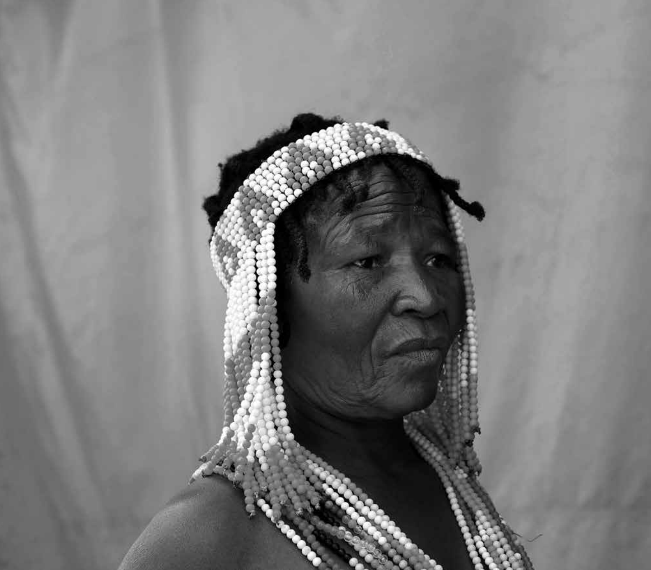
Above: San women dancers in South Africa.

veld food, which plays a vital part in providing food security, particularly to the !Kung San in this area. Ongoing drought has forced many cattle farmers to search for additional grazing areas as available grazing in communal areas has reduced dramatically. This scarcity has been amplified by local elites fencing off areas in other regions for their own purposes.