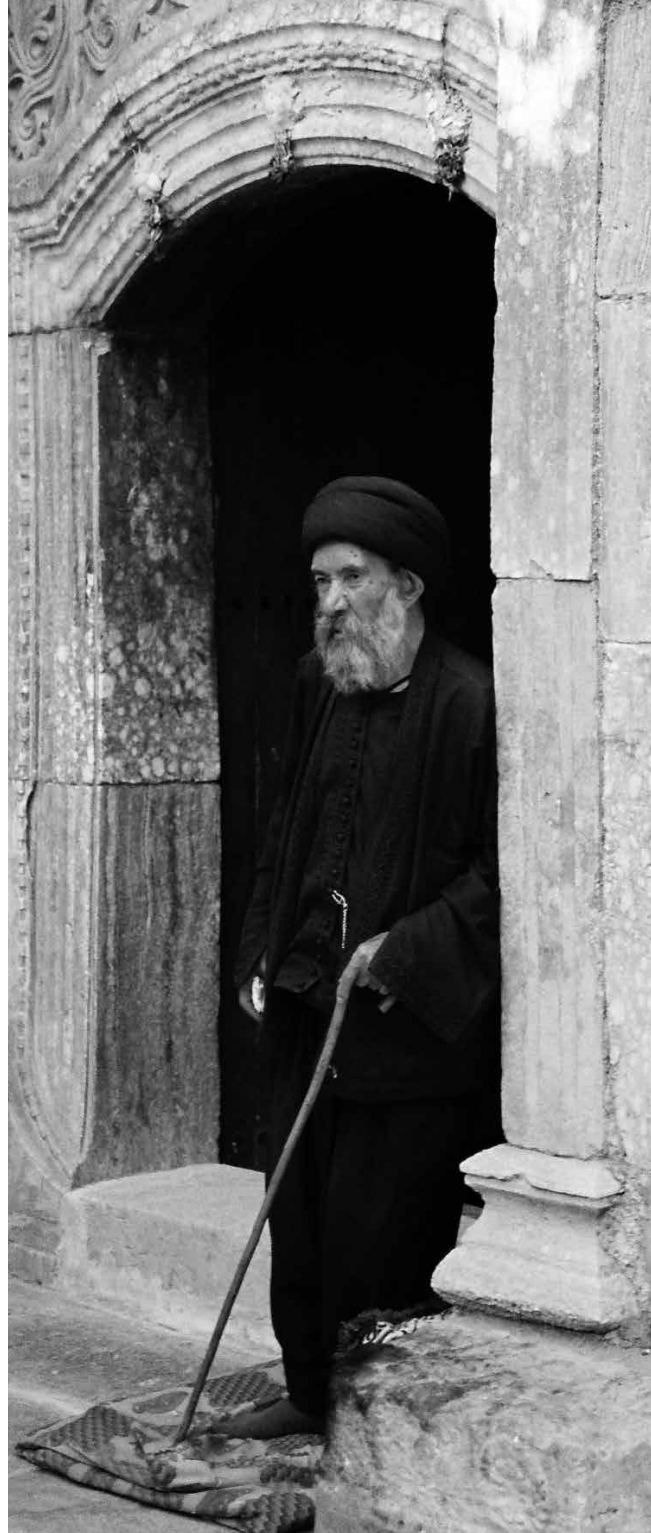
Above: Yezidi man in Iraq.

Another factor is that most minority groups are concentrated in strategic areas such as Baghdad or the oil-rich regions of Mosul, Kirkuk and the Ninewa Plains, where control is disputed between different factions. In these areas, religious and ethnic minorities have been pressured by Arab or Kurdish political groups. Yezidis and Kaka'i, two communities living mainly in the province of Ninewa and around Kirkuk respectively, reported having been subjected to threats and intimidation for their refusal to self-identify as Kurds. The