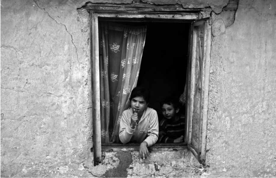
Above: Roma children in Bosnia and Herzegovina.