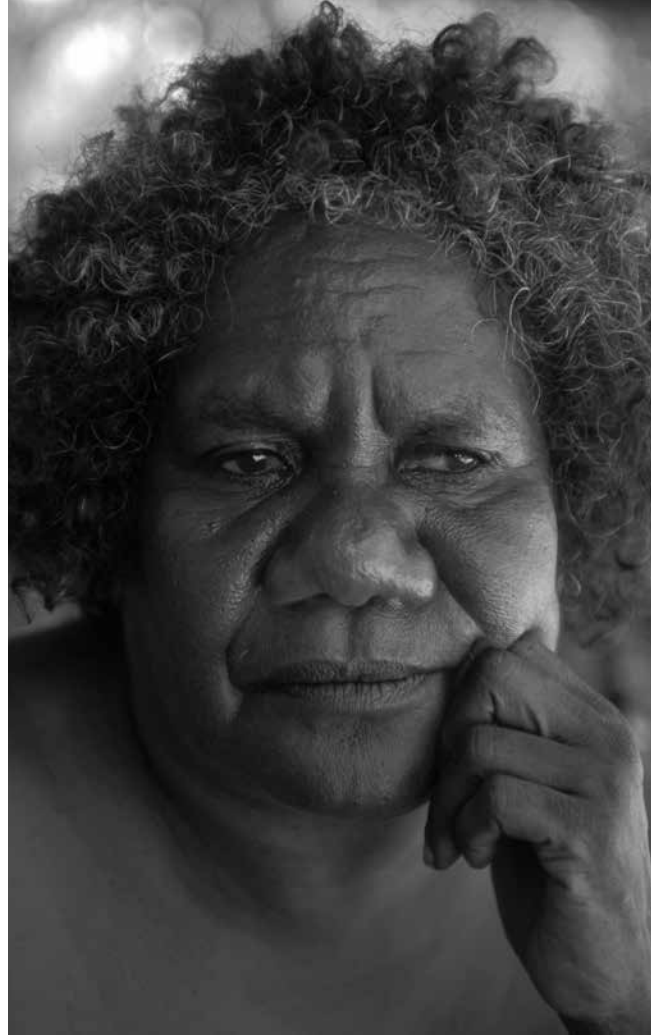
Above: Aboriginal woman in Australia.

The government has undertaken some initiatives to reduce social disparities for its indigenous population, such as the 2008 Closing