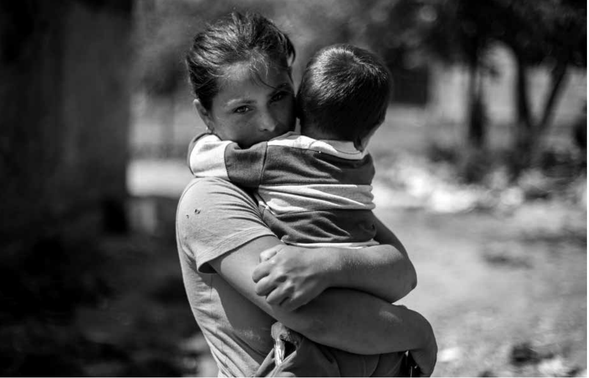
Above: Roma mother and child in Romania.

by complex private and public factors that make them particularly at risk of violence.