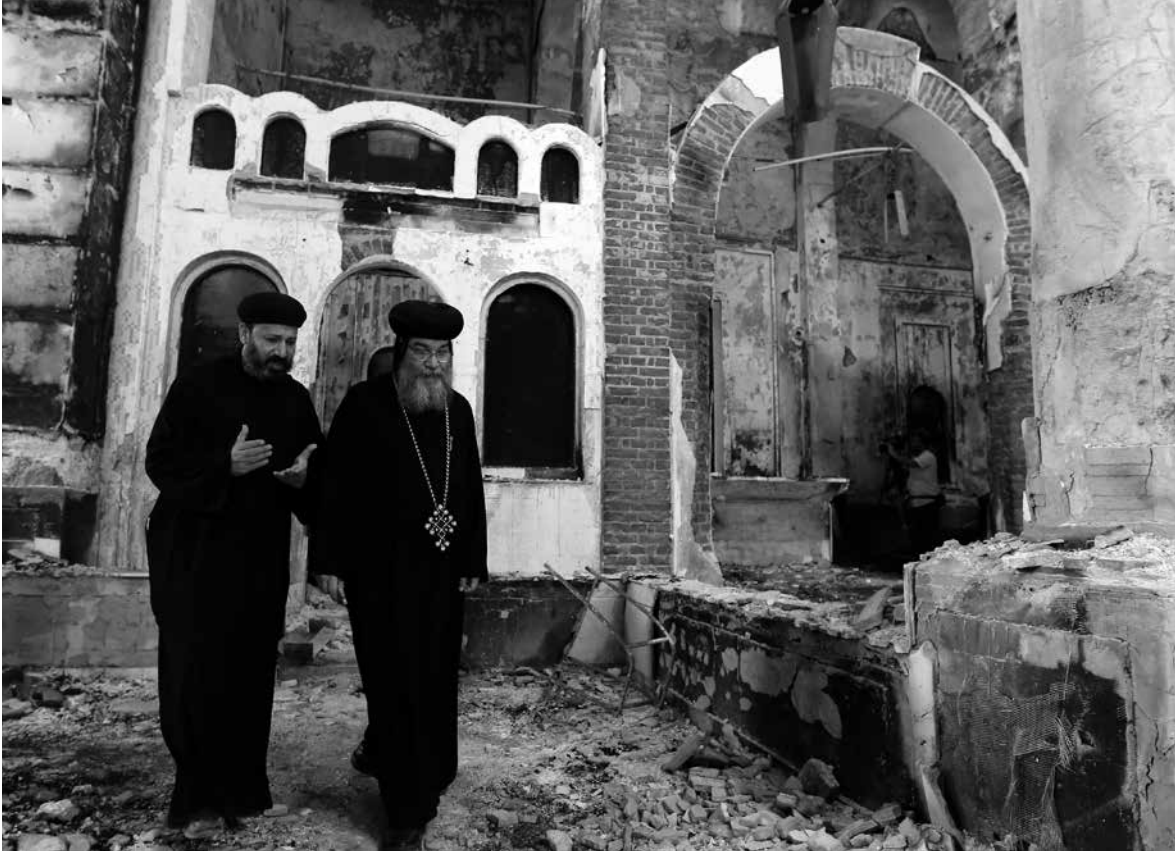
Above: Coptic Christians in Egypt walk around a damaged church.

that Copts had agitated for Morsi's removal and participated actively in the subsequent crackdown. Morsi's Freedom and Justice Party posted a message on its Facebook page warning: 'Christians in Egypt ... deserve these attacks on churches and their institutions. For every action, [there is] a reaction.' As a result, the second half of the year saw repeated attacks against priests, abductions of Copts (including women and children) and frequent assaults on Coptic churches, houses and shops. Instances of local imams inciting violence against Coptic inhabitants were also reported. The violence peaked in August, following the dispersal of sit-ins held by pro-Morsi supporters. Mobs then attacked at least 42 churches, as well as Coptic houses, schools and associations, resulting in heavy damage. Reports of the death toll varied from four to seven people killed.