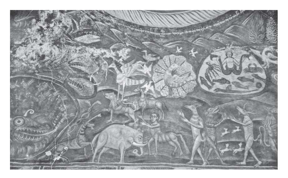
Figure 1 The Beasts of the Earth, south wall of nave. The katholikon of Profitis Ilias, monastery of Roussaki, Kalianeika, 1758

Further verses are illustrated in the background scenes: 'Fire, and hail; snow, and vapours; stormy wind fulfilling his word' (Psalm 148: 8), and in the next verse (148: 9) hills and mountains are depicted along with trees, some of which are intended to be cedars. In some Mani churches fire, hail, snow, ice and wind are sometimes portrayed in human guise — a man coming forth from a cave with a trumpet is one variation on the wind recorded in Mount Athos. However, in the katholikon of the monastery of Roussaki, near Kalianeika, these manifestations of weather are quite literally interpreted on the south ceiling, apart from wind, which is depicted, as on Athos, as the trumpet blast. These interpretations are clearly based on the tradition set by the earliest (fifteenth-century) Ainoi scheme in Mani, at Agios Nikolaos in Zarnata castle.