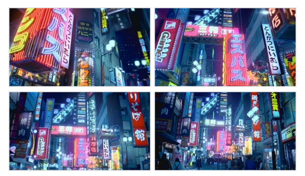
Figure 1. MPC, Tokyo , Channel 4 ident, 2006. Source: MPC, 'Channel 4 Idents,' The Moving Picture Company , 2006, July 17, 2011 <a href="http://www.moving-picture.com/index.php?option=com_content&view=article&id=341&catid=38&Itemid=926">http://www.moving-picture.com/index.php?option=com_content&view=article&id=341&catid=38&Itemid=926</a>>

of most print or screen-based signs. In Dan Waber's typographic animations, Strings (2005), words appear as single strings which unravel and reform into different words; in MPC's Channel 4 idents (2004-2012) architectural objects align to present the figure '4' (see Fig. 1); in BB/Saunders' series of idents for Five, words are formed from groups of independently moving objects, including the word 'free' from balloons and 'fear' from ethereal floating dots; and in Harm van der Dorpel's Type Engine (2005), abstract polygons rearrange to form a sequence of different letters. These and other examples are available online at <u>www.fluidtype.org/typology.html</u>. In all of these artefacts, the identity of forms appears to change over time. At one moment they may appear typographic, but at another they may appear pictorial or abstract. Each form adopts multiple identities over time. This kind of behaviour is distinct from "motion" (a change in location that does not affect the identity or shape of a sign), and from other forms of "kineticism" as identified by numerous theorists in the field of temporal typography. In existing studies of onscreen temporal typography, there is no adequate terminology to describe typography and other paradigms, cannot be considered purely as descendants of static typography.