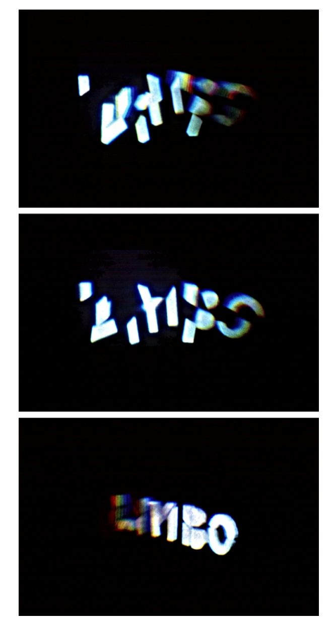
Figure 2. Eduardo Kac, Souvenir D'Andromeda 30x40cm, digital transmission hologram, 1990, Collection Acqaviva-Faustino, Paris. Kac's holographic forms appear to float within the real space between the viewer and the surface of the hologram. The letters of the word 'LIMBO' are composed of apparently three-dimensional objects which align to form letters when seen from the "viewing zone".

Remarkably similar behaviours are observable in onscreen artefacts. In BB/Saunder's Fear ident (Fig. 3), ethereal dots slowly drift through an empty corridor. The experience of holopoetry is replicated, or at least imitated, on screen, with the tracked motion of a camera as a substitute for viewer navigation through gallery space. As the camera tracks through the corridor, the arrangement of dots can be seen at an angle from which it momentarily appears to present the word 'fear'. The ethereal appearance of the dots is suggestive of a ghostly apparition, while the temporary and ephemeral nature of the text identity connotes an uncertainty and insecurity that is a feature of many horror films/programmes. These dots are not only unfamiliar, but unexpected in the corridor setting, making it simpler to perceive them as part of familiar linguistic forms, understood as a graphic overlay of a kind that is common to television idents.