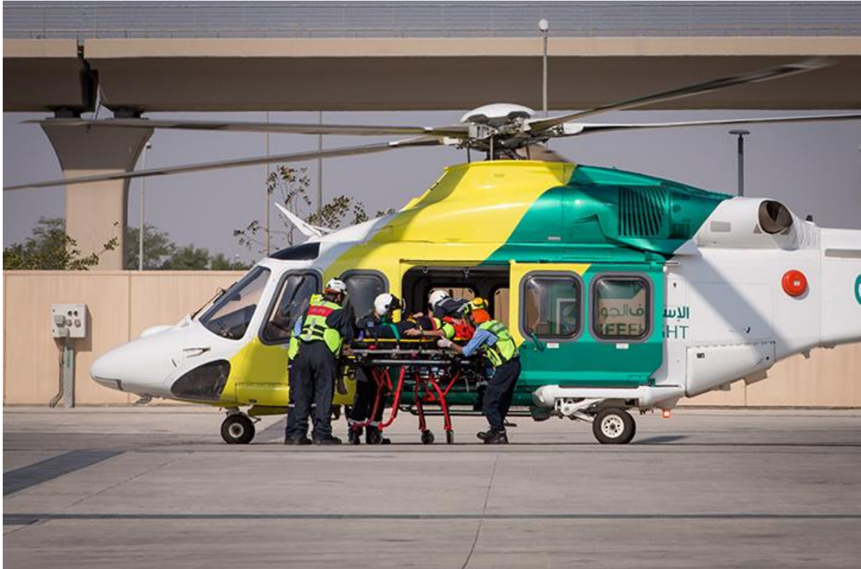
Picture 3: Live demonstration of HMC's helicopter emergency medical service capability.