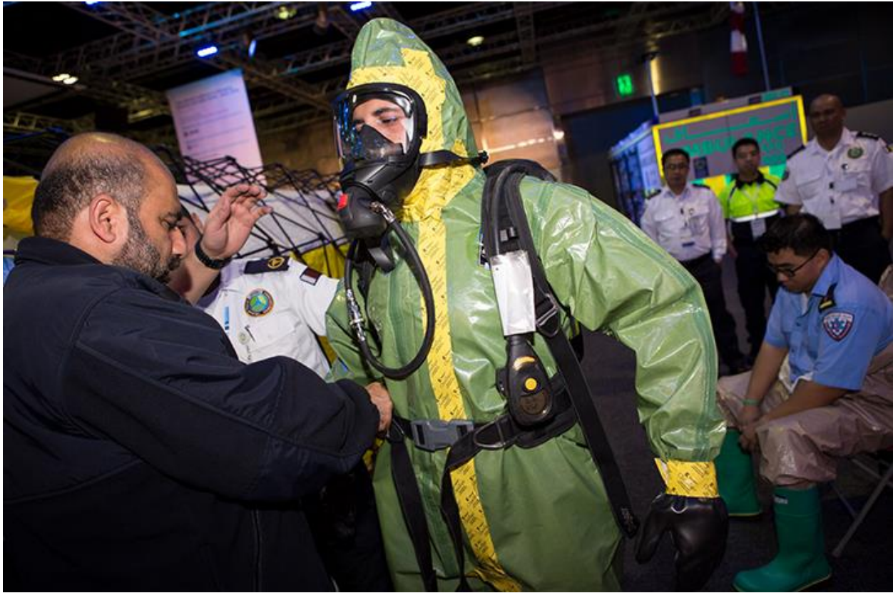
Picture 1: Doffing and donning demonstration by HMC Ambulance Service's Specialised Emergency Management team of a level C hazardous chemical protection suit with breathing apparatus. Picture courtesy of Hamad Medical Corporation, 2016.