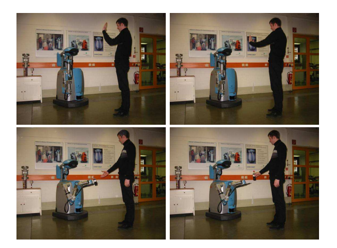
Fig. 1. Gestures with similar kinematics but different functions. Top row: HELLO (left) an interactional gesture (class 4) is similar to STOP (right) a conventional symbol (class 3). Bottom row: PASS OBJECT (left) is similar and TAKE OBJECT are both multifunctional interactional (class 4) and manipulative (class 1) gestures. Activity and situational context – e.g. stage of interaction and current activity (top row), or location of manipulandum, here a bottle (bottom row) – are be used to disambiguate between such kinematically similar gestures.

Multimodal and voice analysis can also help to infer intent via prosodic patterns, even when ignoring the content of speech. Robotic recognition of a small number of distinct prosodic patterns used by adults that communicate praise, prohibition, attention, and comfort to preverbal infants has been employed as feedback to the robot's 'affective' state and behavioural expression, allowing for the emergence of interesting social interaction with humans [3]. Hidden Markov Models (HMMs) have been used to classifying limited numbers of gestural patterns (such as grasps or letter shapes) and also to generate trajectories by a humanoid robot matching those demonstrated by a human [2]. Multimodal speech and gesture recognition using HMMs has been implemented for giving commands via pointing, one-, and two-handed gestural commands together with voice for intention extraction into a structured symbolic data stream for use in controlling and programming a vacuuming cleaning robot [8]. Many more examples in