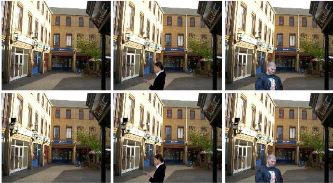
Figure 2. The stimulus pictures, top row without CCTV, left column, absent target, middle column, female target, and the male target is on the right