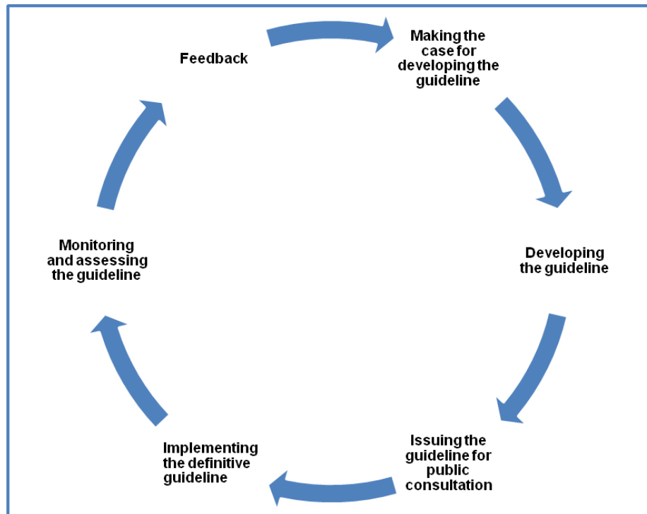
Figure 3. Guideline development process

(Figure 3) was used in the discussions, which includes: making the case for developing the guideline, developing the guideline, issuing the guideline for public consultation, implementing the definitive guideline, monitoring and assessing the guideline, and feedback. This has since been updated (see Figure 1).