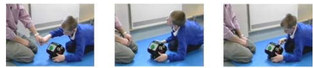
Fig. 4. Example of Experimental Investigation scenario of a turn-taking game with a sensory reward (Legorobot).

The game is played using the stationary inanimate robot (Legorobot), and consists in a turn-taking game with a sensory reward. The robot is placed on the floor and the participants are sitting around it (see fig. 4). The objective of the game is to engage the child in a collaborative turn-taking game with another person, whilst having enjoyment and sensory rewards (lights) as a result.