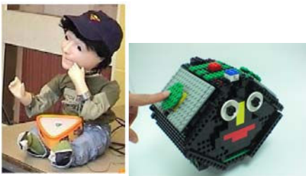
Fig. 2. The two robots that were used in the trials: Kaspar (left) and Legorobot (right).

b) LEGOROBOT - a small mobile robot that was developed specifically for a simple turn-taking and sensory game for children with autism (see figure 2 right).