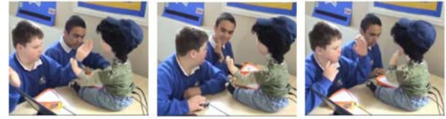
Fig. 3. Example of Experimental Investigation scenario of robot mediated interaction between peers (Kaspar).

The objective of the scenario is to engage the children in an interactive play activity and in an imitation game where they are in control of the activity. These enable the actors to play together an imitation game (mediated by the robot).