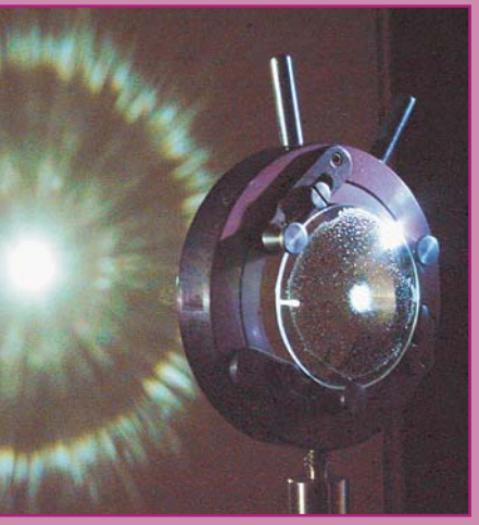
A Halo in the lab: bright patches produced by a few hundred crystals deposited on a glass circle combine into a ring with a 22-degree inner radius.

Halo produced by moonlit cirrus cloud. The faintly coloured ring is at an angle of 22 degrees from the moon. You can also see two aircraft contrails, the upper one casting a shadow onto the thin layer of cirrus.