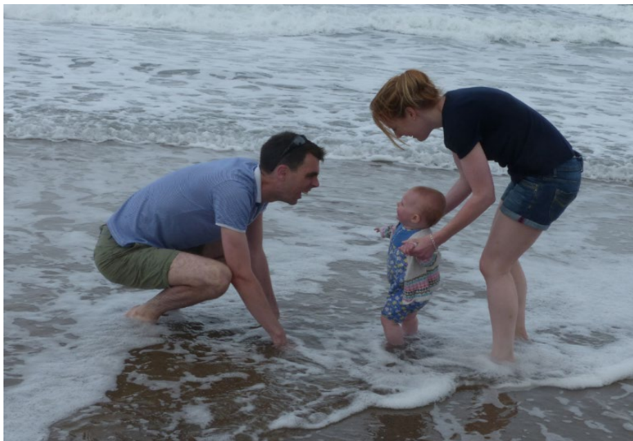
Figure 3.4 Early connections with meaningful places protected by the National Trust

There is significant qualitative evidence that supports the need for humans to engage with nature and the natural world, as shown in Figure 3.4.