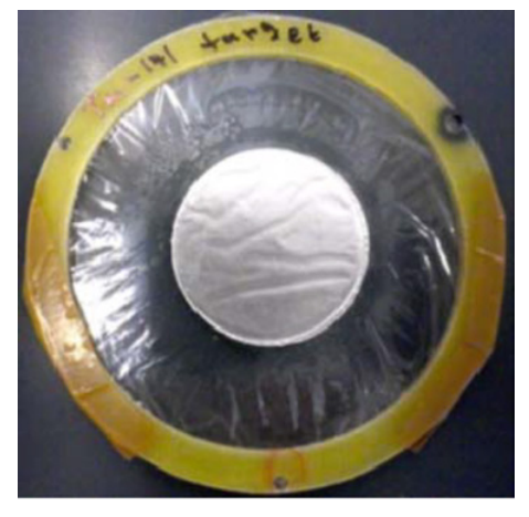
Figure 1. Picture of the <sup>171</sup>Tm target.

In this work, we add three more items to the list of measured isotopes. We have produced sizable quantities of <sup>147</sup>Pm, <sup>171</sup>Tm and <sup>204</sup>Tl inside the ILL high flux reactor, purified the material, made suitable targets out it [4], and measured the corresponding capture cross section by time-of-flight at the CERN n_TOF facility [5,6] and by activation at LiLiT [7]. Since the data analysis is ongoing, this paper does not include final results but a description of the experiments and an outlook of the analysis and expected results.