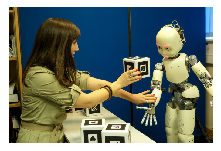
Fig. 4. The interaction partner prohibits the robot DeeChee from reaching the forbidden object physically and verbally, allowing the learning robot to associate this experience with the spoken "No". (Photo by Frank Förster, who led the work on linguistic negation).

to manipulated objects and their properties, as validated by grounded usage in context with participants (and also by assessment of internal sensorimotor associations); (3) one-, two- and sometimes multi-word utterances used meaningfully in the context of this teaching scenario; and also (4) capability to use a variety of forms of linguistic negation.