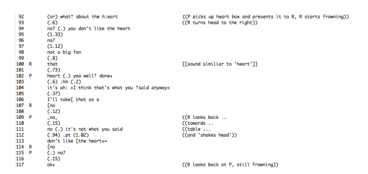
Fig. 7. Negation Experiments: Truth-Functional Denial (line 107) and Negative Agreement (line 114) exhibited by the humanoid robot DeeChee. R marks the robot's utterances and P the human participant's when there is a change of speaker.

We have employed experiential intelligence in enactive cognitive architectures for the acquisition via informationtheoretic self-structuring of sensory fields and selforganization of sensorimotor control, as well as for socially regulated and embedded behaviours, including skills acquired by imitation, development of turn-taking and autonomous selection of behaviour in response to social contingency and engagement in habitual learning via long-term human-robot interactions. We have shown how aspects of language as motor activity in such contexts, including grounded reference, two-word utterance, and negation can be acquired using a radically enactive approach. More general learning of these interaction games by making use of teleological understanding [53] in contexts of habitual purposeful engagement is the usual context of child language development, and also the arena of meaningful language use. We aim to further emulate this development in humanoid robots by continuing to harness information self-structuring and insights of the enactive paradigm.