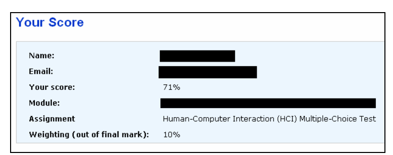
Figure 1: Screenshot illustrating how overall score was displayed within our automated feedback prototype. The student's name and module have been omitted.

The overall score, or overall proficiency level, would be estimated by the CAT algorithm using the complete set of responses for a given test-taker and the adaptive algorithm introduced in section 2.1. Figure 1 illustrates how this information was displayed within our automated feedback prototype.