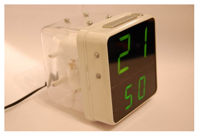
Figure 5: Example of completed Alarm Clock