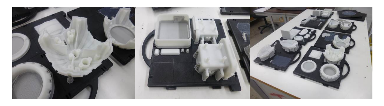
Figure 4: Printed Components from the RP Machine

A key purpose is to get the physical and virtual environments linked in both design process and students understanding of it. With the later the project also challenged students to understand the complexities of moulding, particularly plastic parts. This depth of understanding is valuable in the graduates portfolio when making the transition from education to employment. In this there is not an acceptance of clicking a button to print out what is on screen but an understanding of the value of both environments within the design process. Importantly students gain an understanding of when a process or skill is appropriate. They have to justify design decisions on detail before CAD Files are signed off by staff and sent to the 3DP machine(s). Within this they have to prove an understanding of how a component is designed for a particular manufacturing process and material, predominantly injection moulded plastic(s).