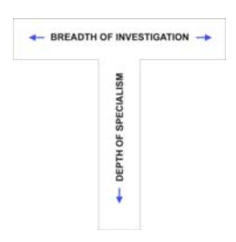
Figure 1: T shaped Design

In many instances projects deal in methodology and design thinking often culminating in design propositions outlining a concept, physical presence and interaction. Although valuable, an understanding of manufacturing detail is being reduced or marginalised. Although Universities have become strong on the breadth of investigation and Design Thinking students often lack a depth of knowledge, in this instance of detailing for manufacture. The UK Design Council describes this interdependency the T of Design, Figure 1.