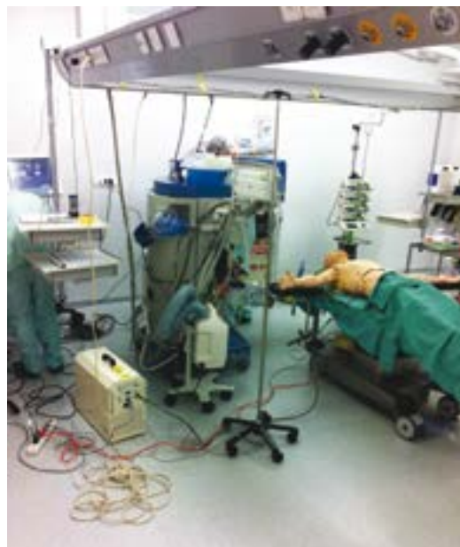
Figure 2: Simulation equipment setup in an operating theatre.

In fact, in-situ simulation allows the healthcare professionals to learn and develop their experiences in their usual working environment, i.e. the same location where they provide patient care, apply their knowledge, and use their experience in the best interest of patients (37). The work that is done in simulation centres enables to address a wide array of learning objectives but nothing replaces field experience where other specific lessons can be learnt. According to Mondrup et al. this field of simulation is particularly useful to identify the weaknesses of a care unit or potential errors. Implementing simulation within a system allows the early identification of all loopholes, provides an opportunity of addressing them, and improves patient safety (38). Surcouf et al. developed simulation sessions for interns who move from one service to the other and sometimes finish their internship without being confronted to a single vital emergency (39).