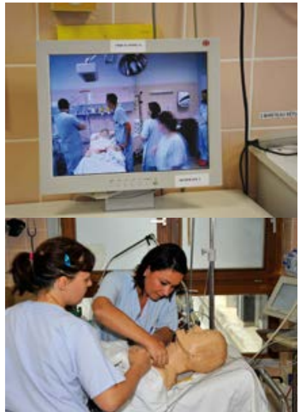
Figure 4: Example of the use of audio-video recording equipment during an in-situ scenario with a patient simulator.

In a period of tight management of budgets, in-situ simulation can prove to be a very viable option. For example, Weinstock et al. developed a mobile simulation cart. It looks like a hospital trolley and incorporates all the equipment required to control their paediatric patient simulator. It helps provide high-fidelity simulation experiences at low cost. The operator computer is compatible with several patient simulators and enables the recording and debriefing of a session. Its cost is estimated at less than 10,000 dollars excluding the patient simulator (34) ( Table 2 ).