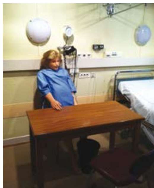
Figure 3: Patient simulator setup in a patient ward for an obstetrics scenario.